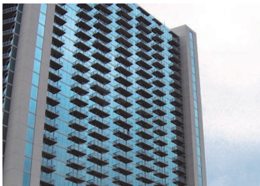
apartments & condominiums

ACOUSTICAL PERFORMANCE CRITERIA: DESIGN REQUIREMENTS AND GUIDELINES FOR SCHOOLS