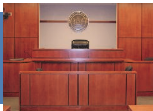
GSA Court Facilities