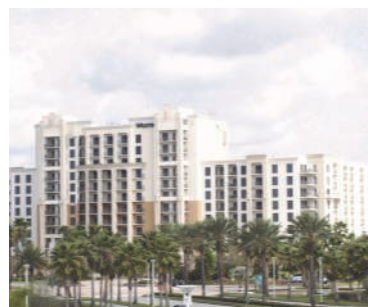
HOTELS & MOTELS—GROUP R